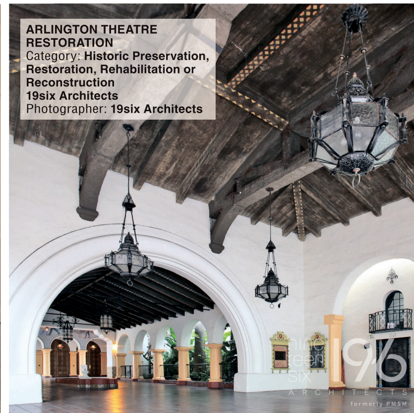
ARLINGTON THEATRE RESTORATION Category: Historic Preservation, Restoration, Rehabilitation or Reconstruction 19six Architects