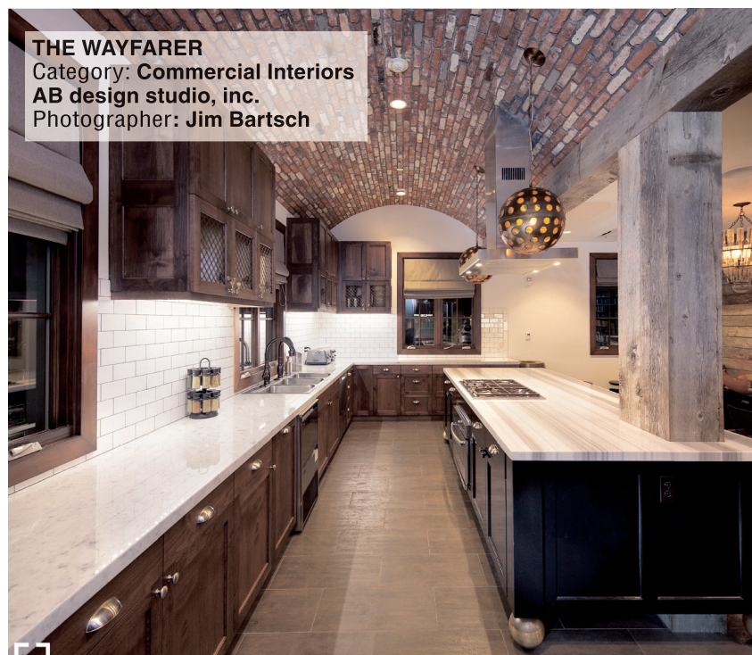
THE WAYFARER Category: Commercial Interiors AB design studio, inc.