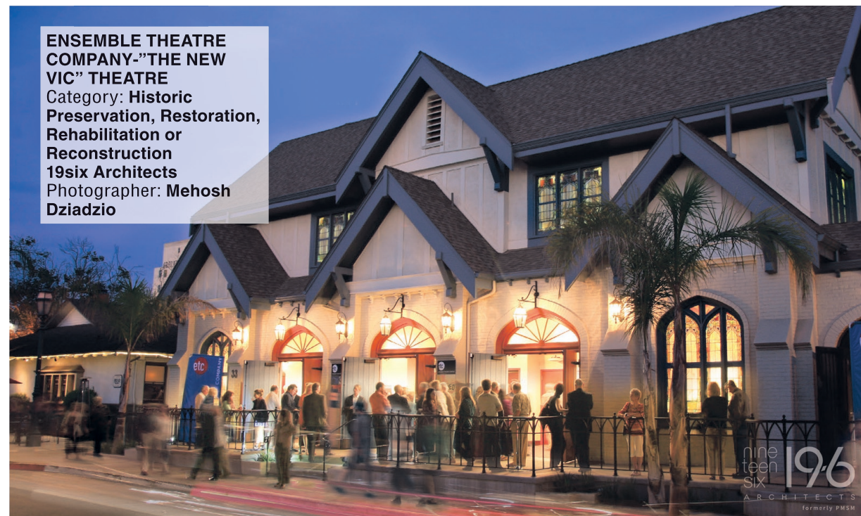
ENSEMBLE THEATRE COMPANY-"THE NEW VIC" THEATRE Category: Historic Preservation, Restoration, Rehabilitation or Reconstruction 19six Architects