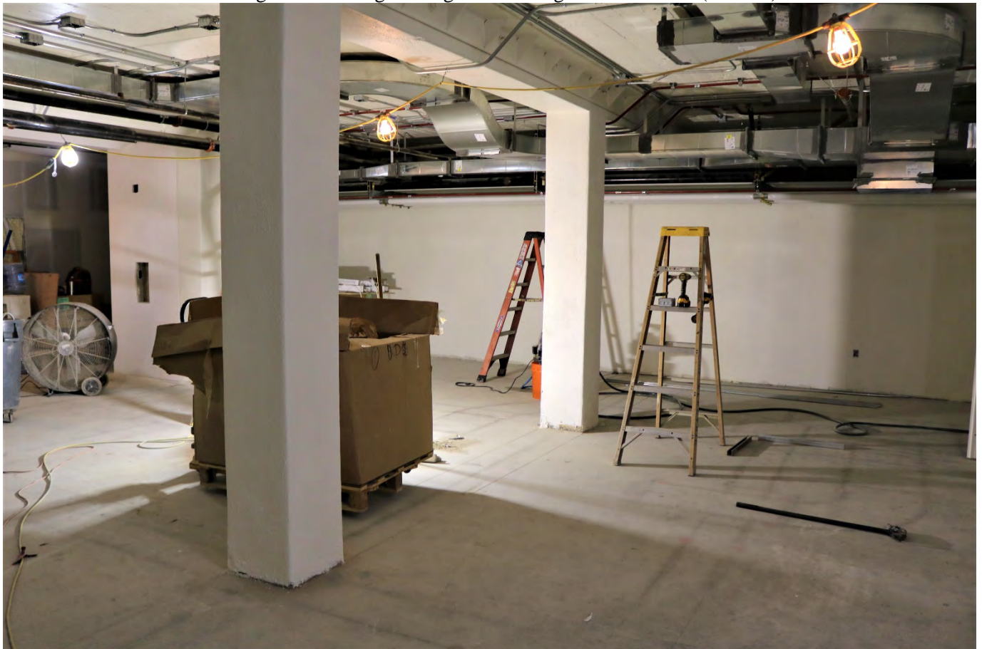
Receiving and Conservation areas (1/17/20).