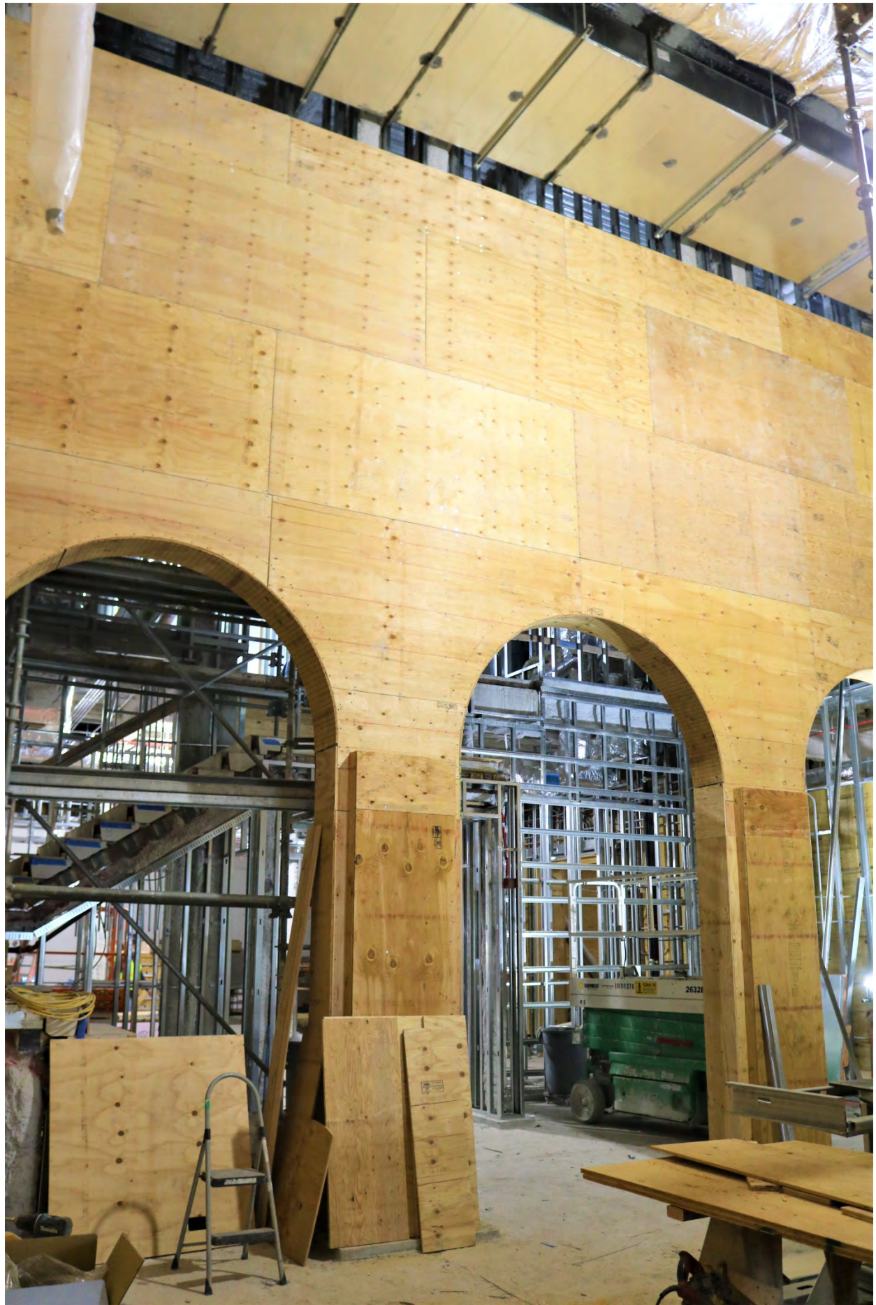
Ludington Court (Grand Staircase directly behind) (1/30/20).