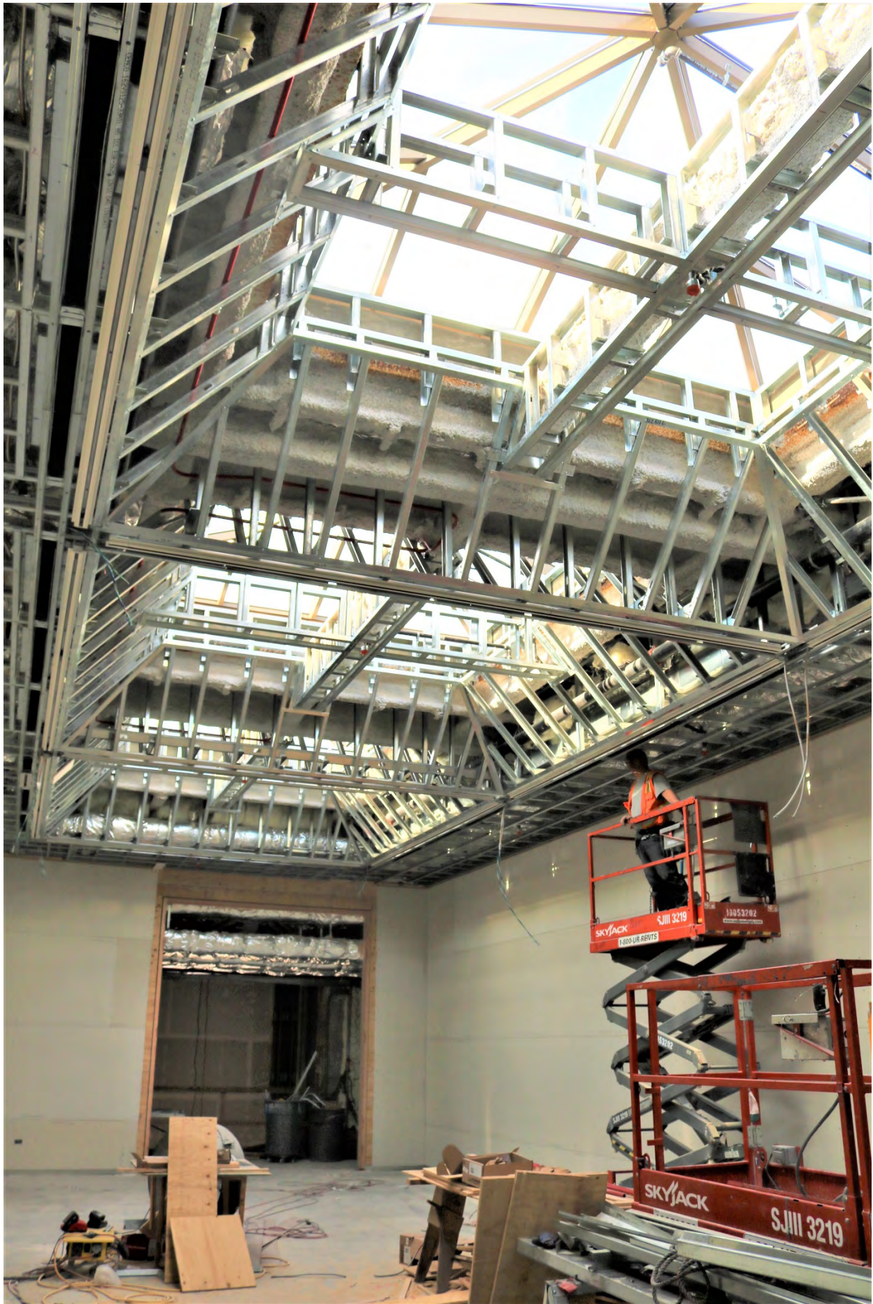
Contemporary gallery (UL McCormick) now has walls (1/8/20).