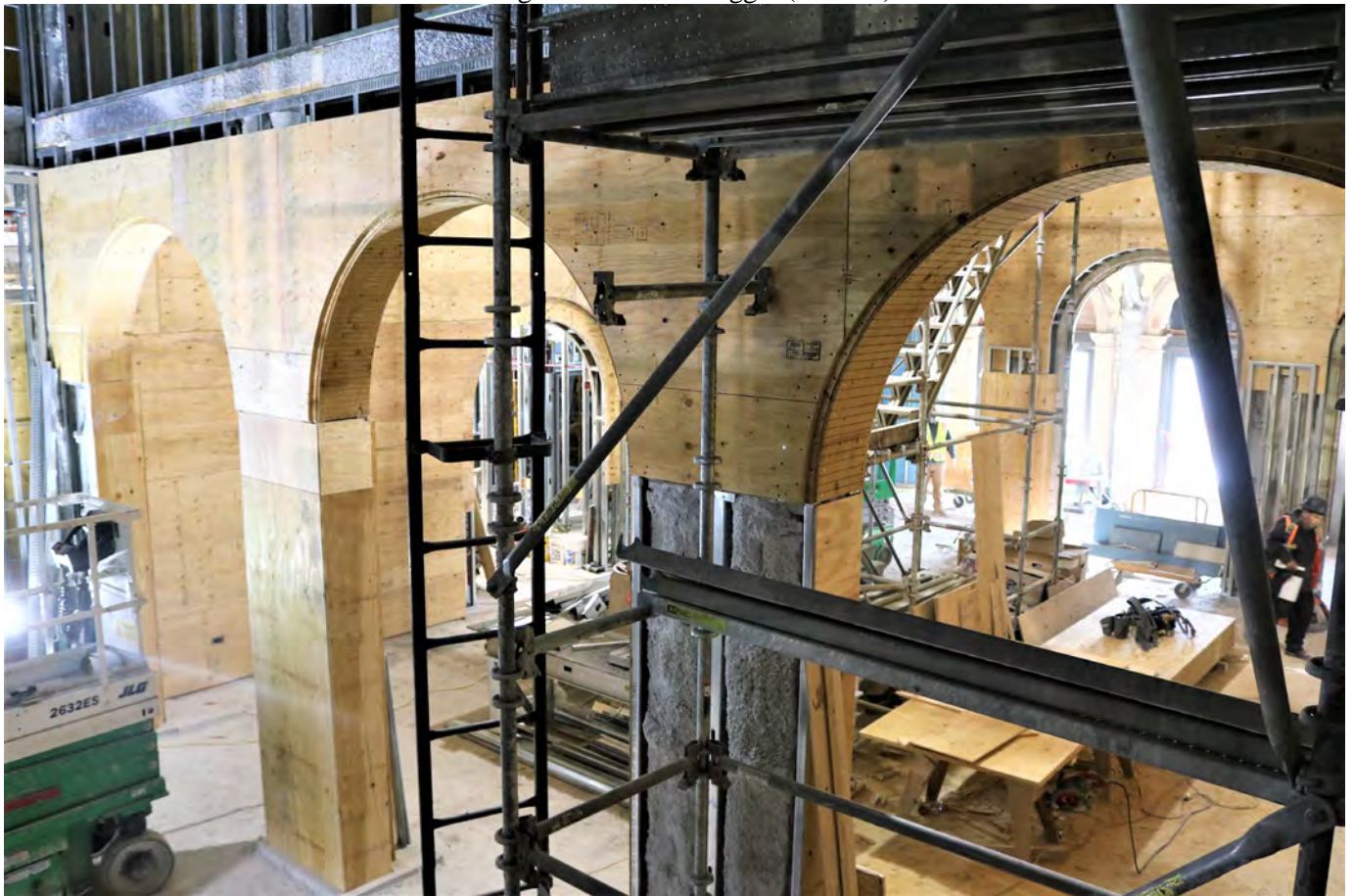
Ludington Court from Thayer (1/30/20).