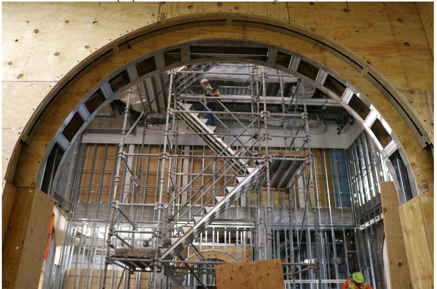
Ludington Court from Campbell/Gould galleries (1/17/20).