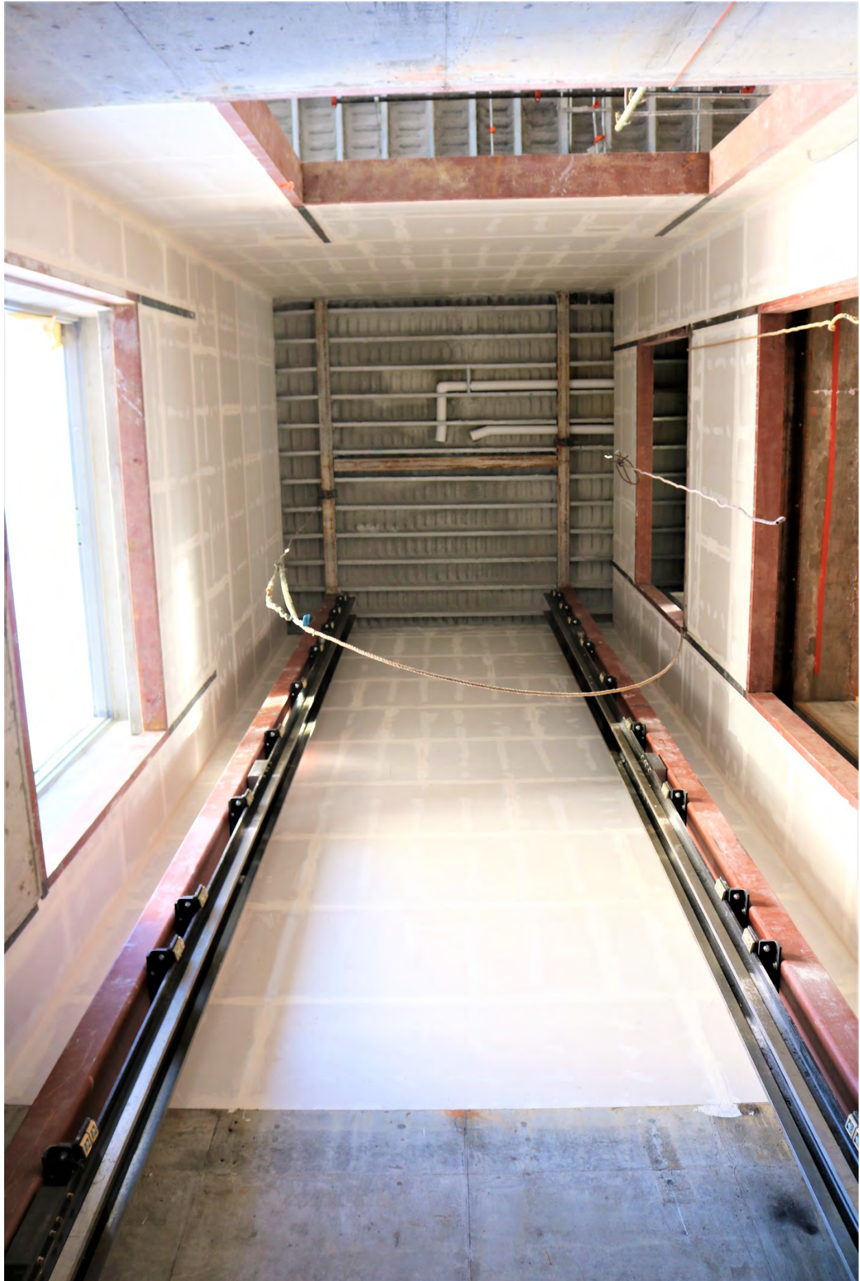
ARF elevator shaft looking toward guide rails (1/17/20).