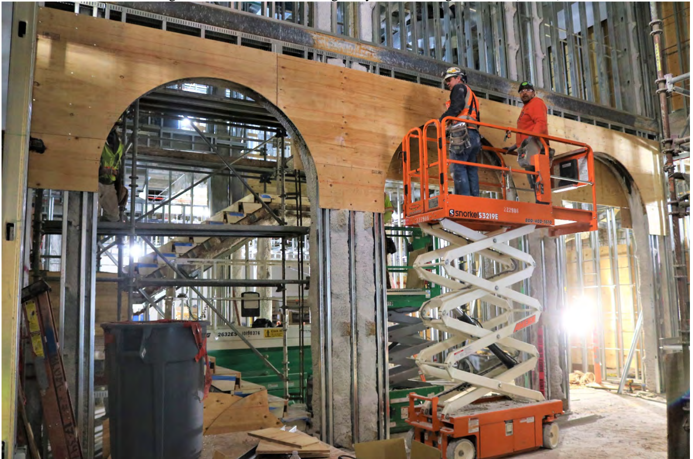
Installing wood panels for the archways in Ludington Court (1/17/20).