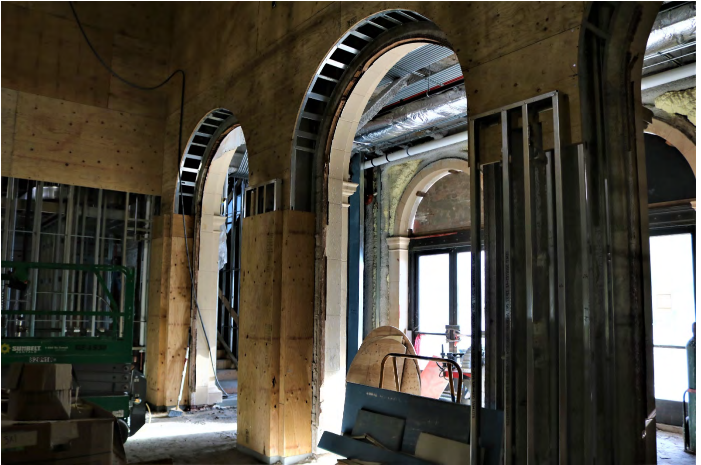
Ludington Court and Loggia (1/30/20).