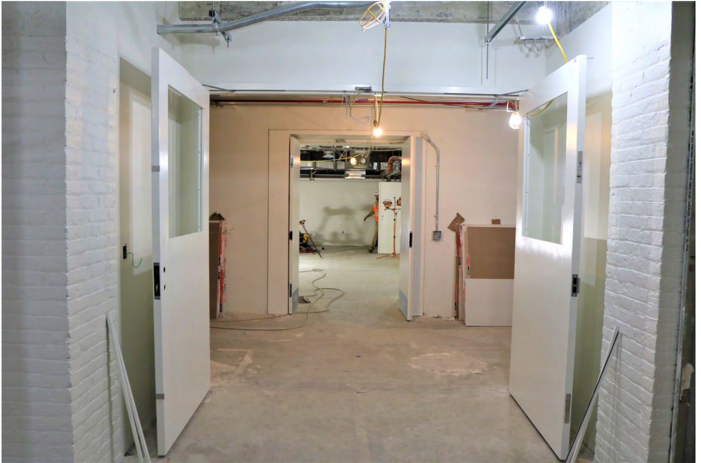
Looking from Packing/Crating towards Registration offices (1/30/20).