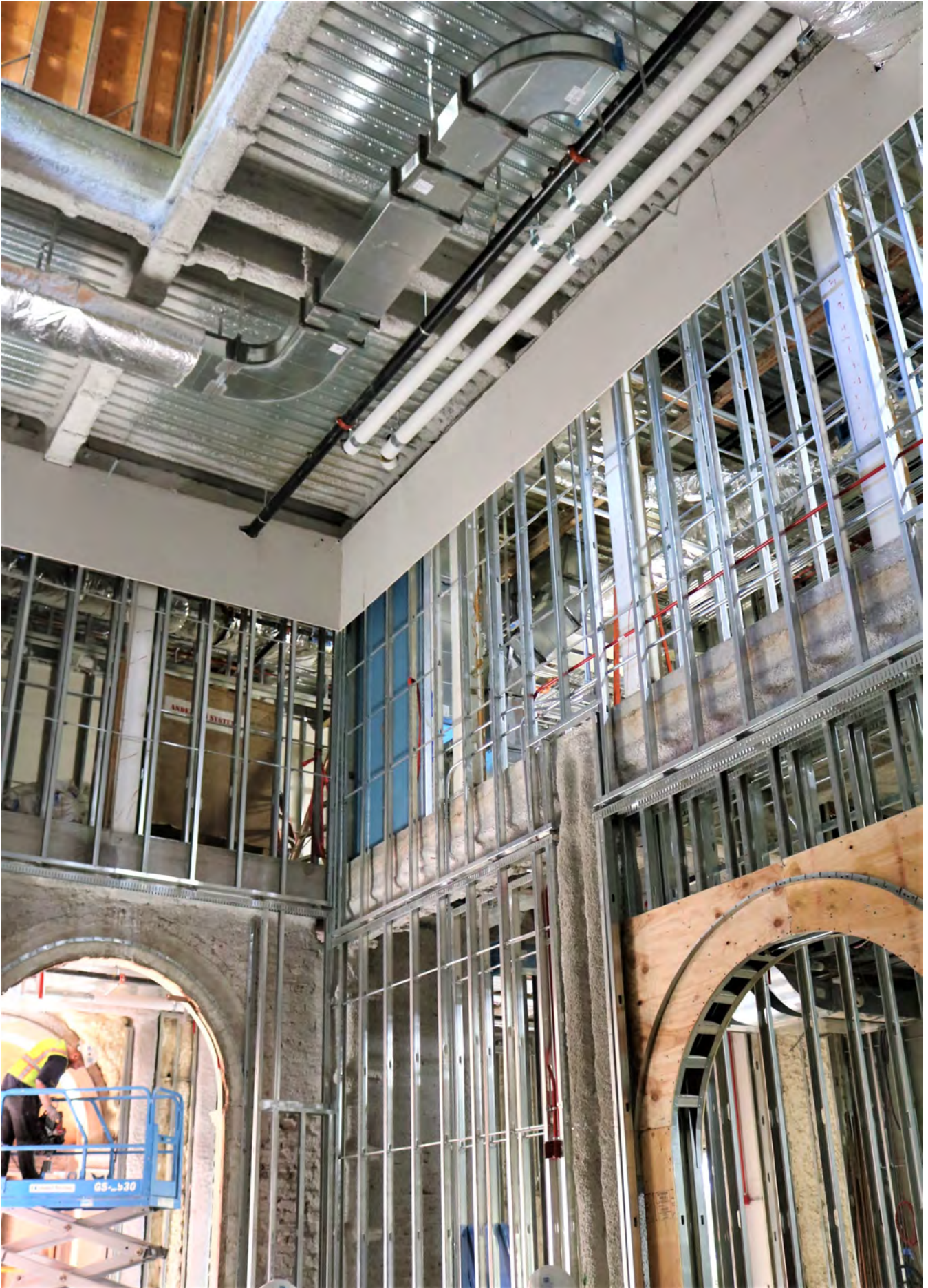
Ludington Court: exposed ducting and pipes, steel framing for walls, and new arches (1/8/20).