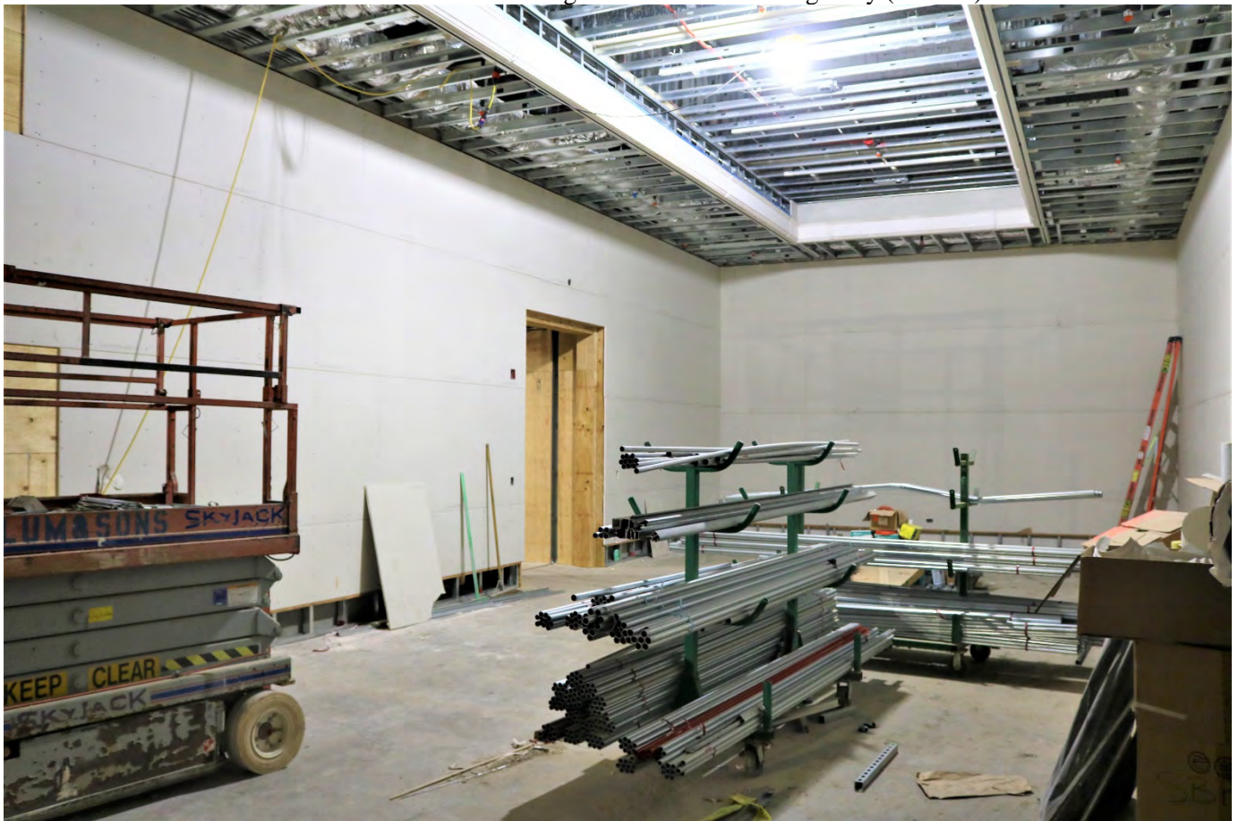
Sterling Morton gallery (1/30/20).