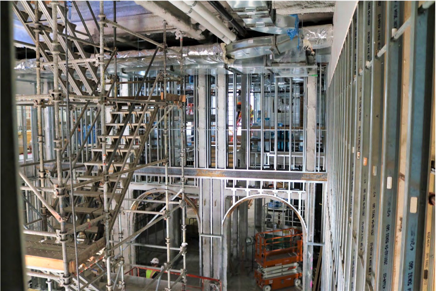
Looking towards UL McCormick gallery from Ludington Court (1/8/20).