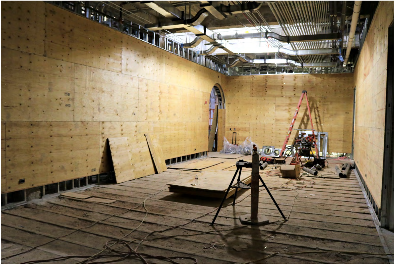
Campbell/Gould galleries (1/17/20).