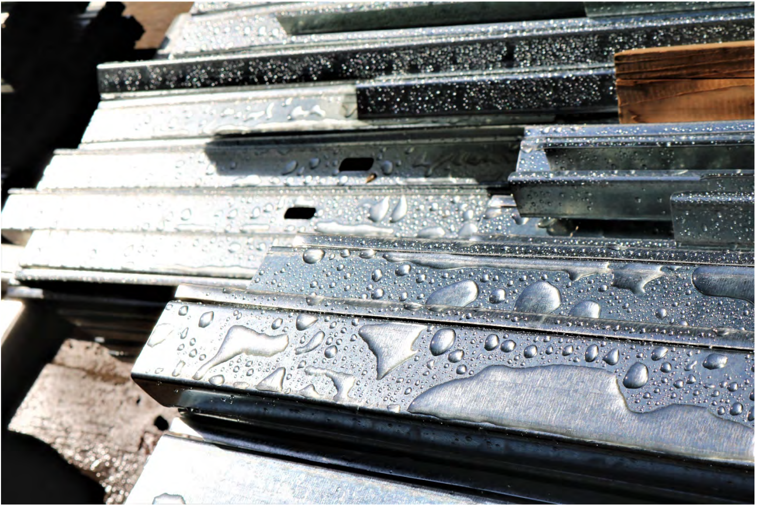
Rainwater and Steel Framing