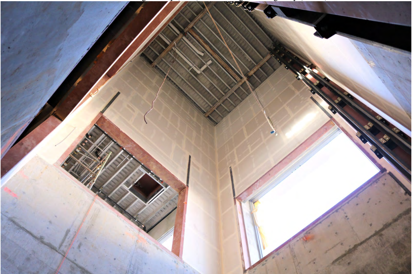
Inside the ARF elevator shaft. Two of three doorways visible, third doorway is upper left (1/17/20).