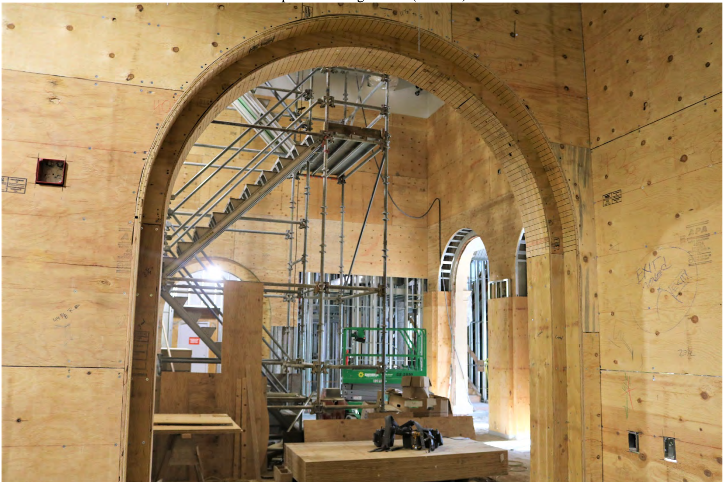
Looking into Ludington Court from Campbell/Gould galleries (1/30/20).