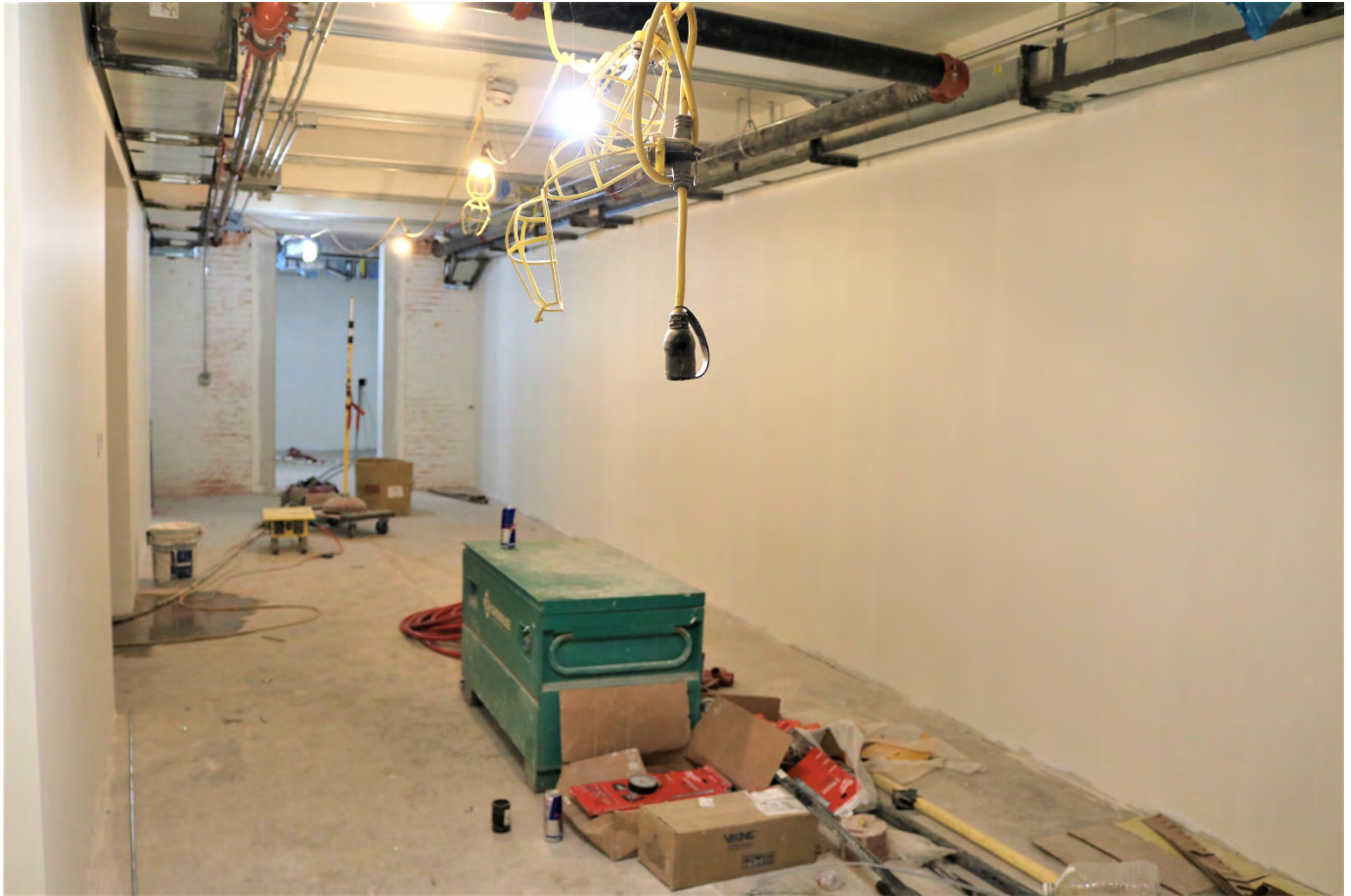
Art storage (Post Office basement) (1/17/20).