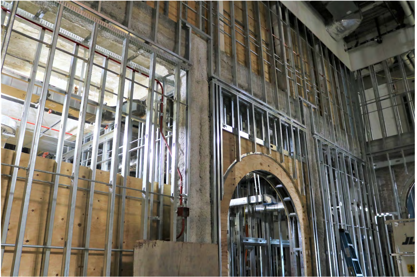
Another perspective of the future walls inside Ludington Court (1/17/20).