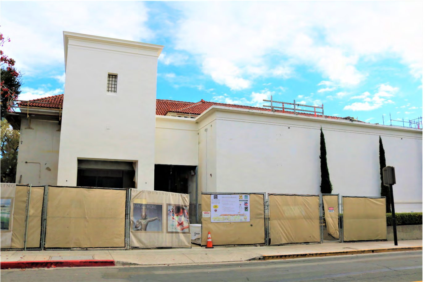
The Art Receiving Facility (ARF) and Sterling Morton gallery (1/8/20).